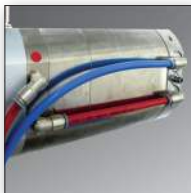
XWT-300-CT Plus with new cooling circuit