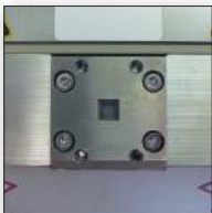
XWT-300-CT Plus with new collimator