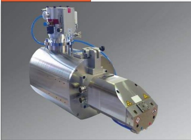
Microfocus X-ray tube XWT-300-CT Plus